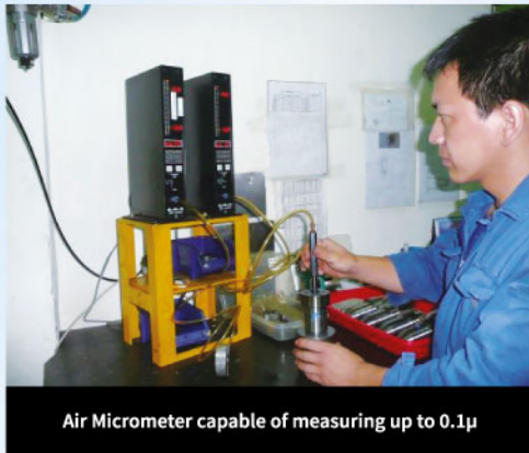
Air Micrometer capable of measuring up to 0.1μ