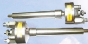
Cylinder Lubricator SIP Valves