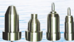
Main Engine Nozzles