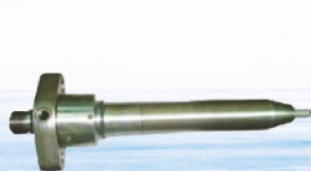
B&W Fuel Injection Valve Overhaul