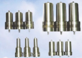
Auxillary Engine Nozzles