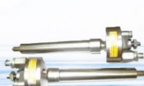
Cylinder Lubricator SIP Valves