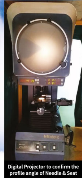
Digital Projector to confirm the profile angle of Needle & Seat