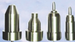
Main Engine Nozzles