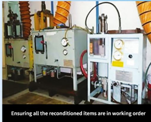
Ensuring all the reconditioned items are in working order